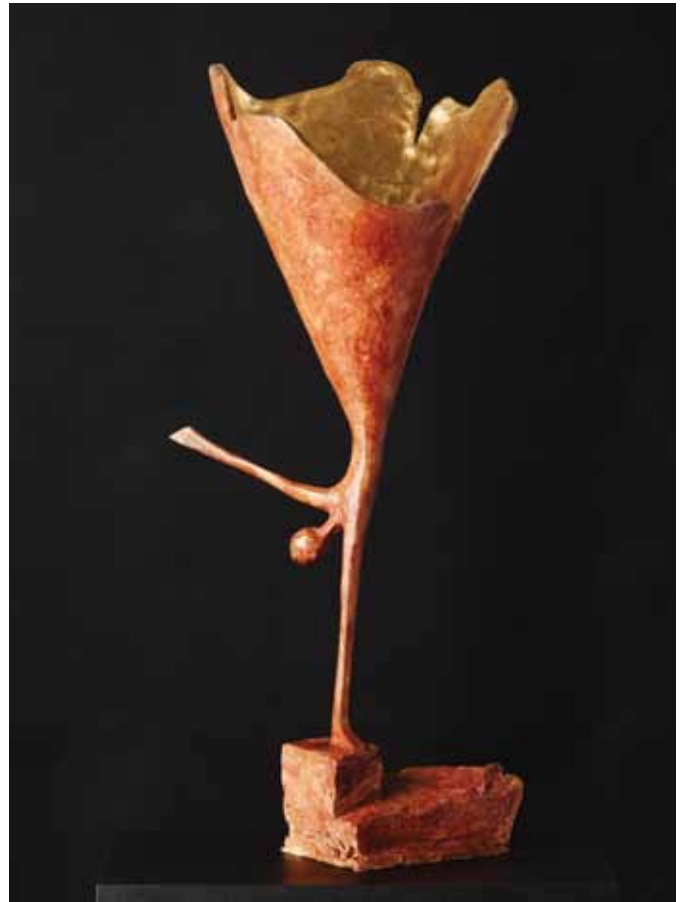
Carol Peace 'Vessel III' Bronze (ed of 25) 49 x 20 x 20cm £2,460