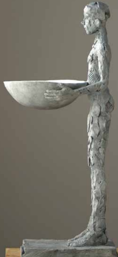
Carol Peace 'Bird Bath' Bronze (ed of 25) 56.5 x 18 x 26.5cm £5,720