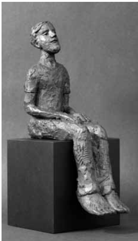
Carol Peace 'Bearded Man' Iron Resin (ed of 25) 20 x 10 x 9.5cm £640 Also available in bronze: £1,980