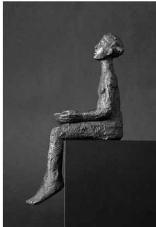
Carol Peace 'Bird Bath' Iron Resin (ed of 25) 18 x 10 x 9.5cm £640 Also available in bronze: £1,980