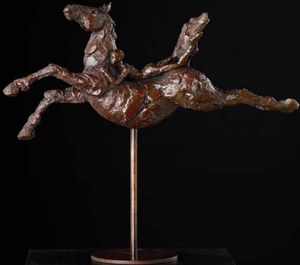
Carol Peace 'Merry go Round' Bronze (ed of 25) 37 x 12 x 43cm £4,950