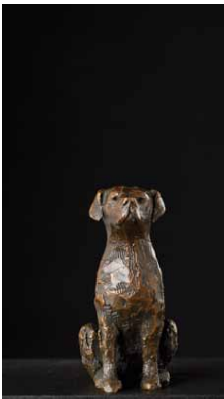
Carol Peace 'Dog' Bronze (ed of 25) 8 x 3.5 x 6cm £990