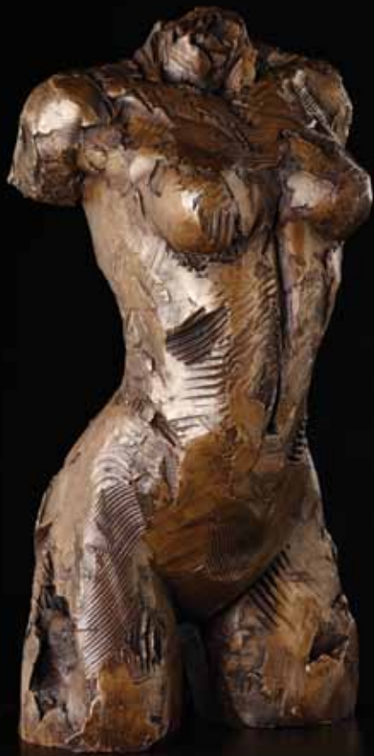
Carol Peace 'Torso' Iron Resin (ed of 25) £750