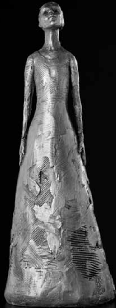
Carol Peace 'May' Iron resin (ed of 120) 34 x 12.5 x 11cm £325