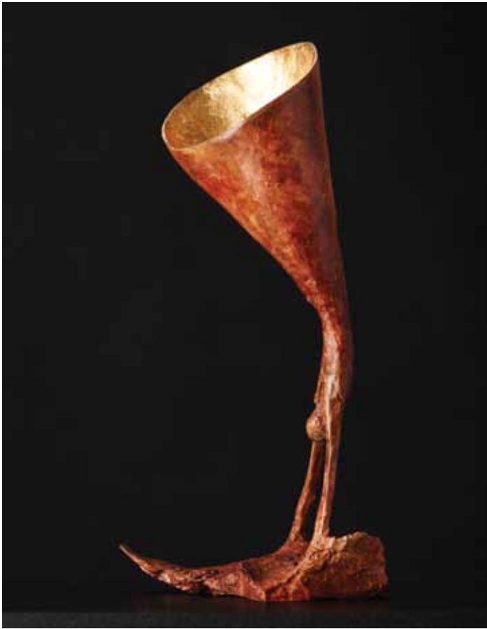
Carol Peace 'Vessel II' Bronze (ed of 25) 23 x 11 x 11cm £1,320