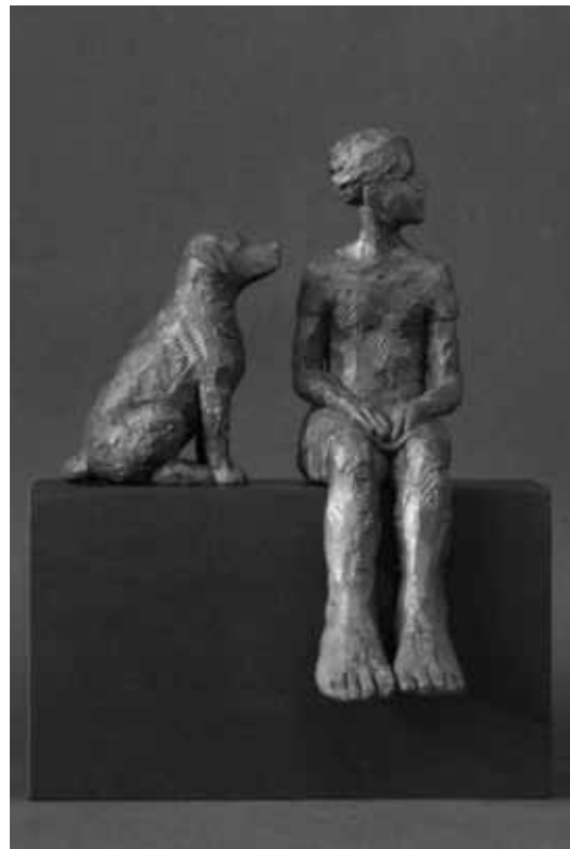
Carol Peace 'Waiting' Iron Resin (ed of 25) 20 x 10 x 9.5cm £765 Also available in bronze: £2,310