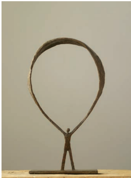
Shoot Edition of 25 in bronze 21 cm high