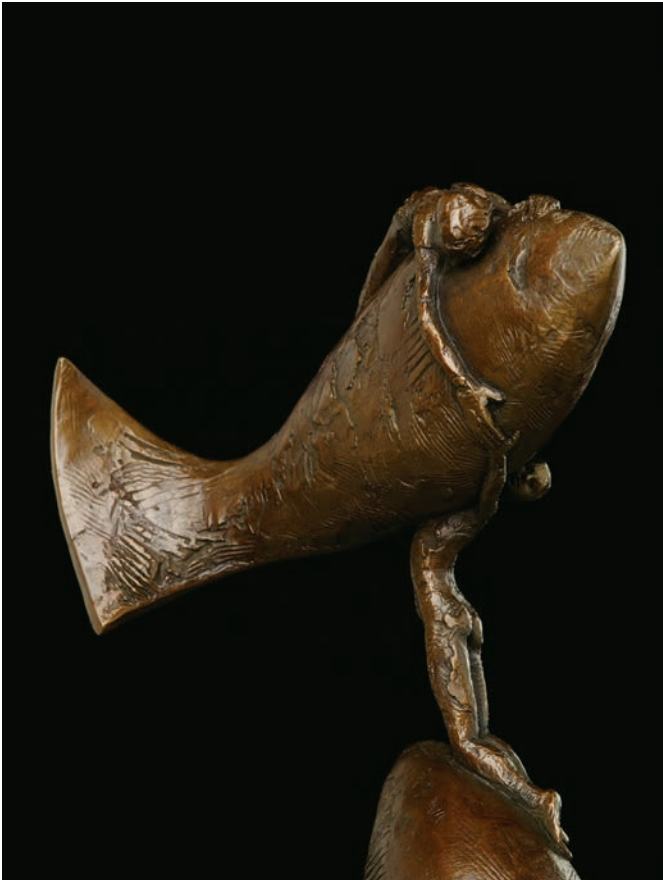
Three Fishes Edition of 14 in bronze 44cm high