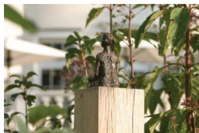
Block People Editions of 25 in bronze with oak column. Also available in bronze resin or iron resin on a wooden wall-mounted block, suitable for use indoors. Figures approximately 14cm high