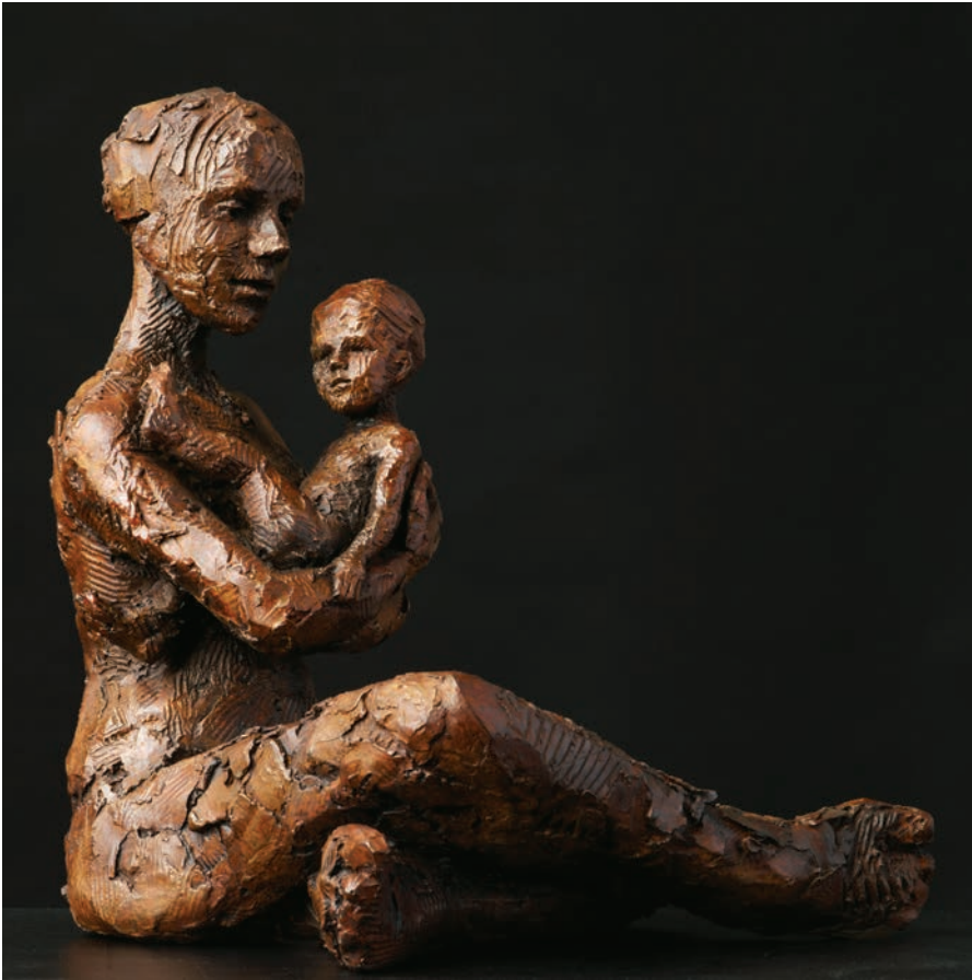
Mother and Child Edition of 25 in bronze/iron resin 21cm high