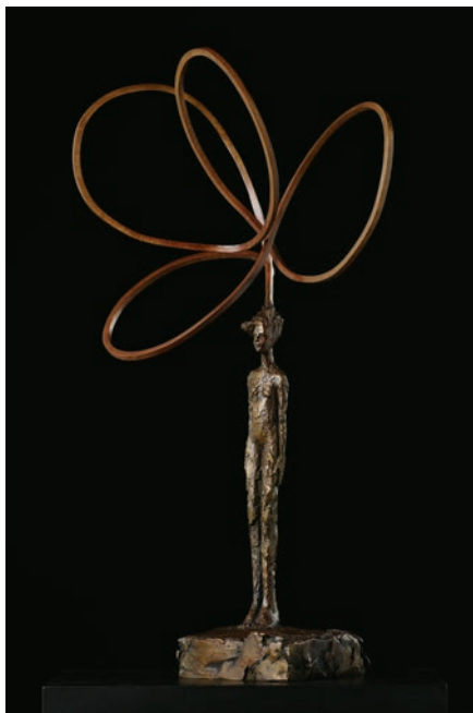
Head Spin Edition of 25 in bronze 49cm high