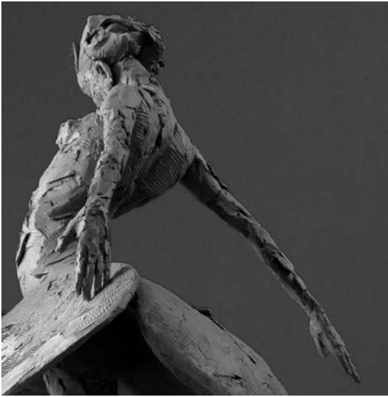
Clover Edition of 14 in bronze 44cm high