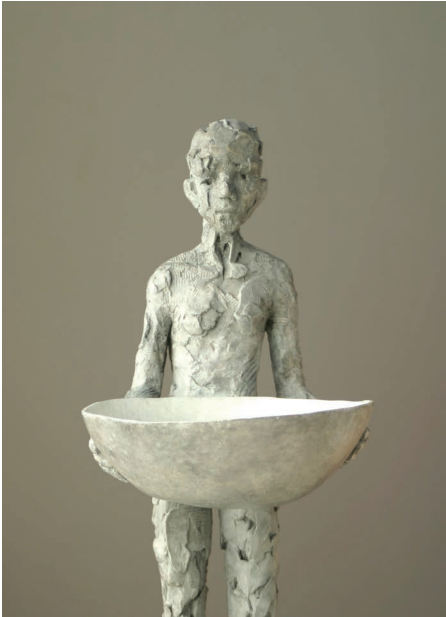
Bird Bath Edition of 14 in bronze 57cm high