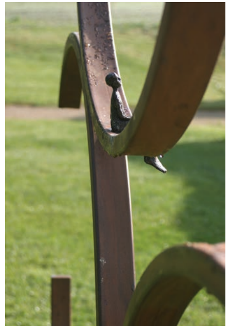
Family 5 Edition of 9 in mild steel and bronze