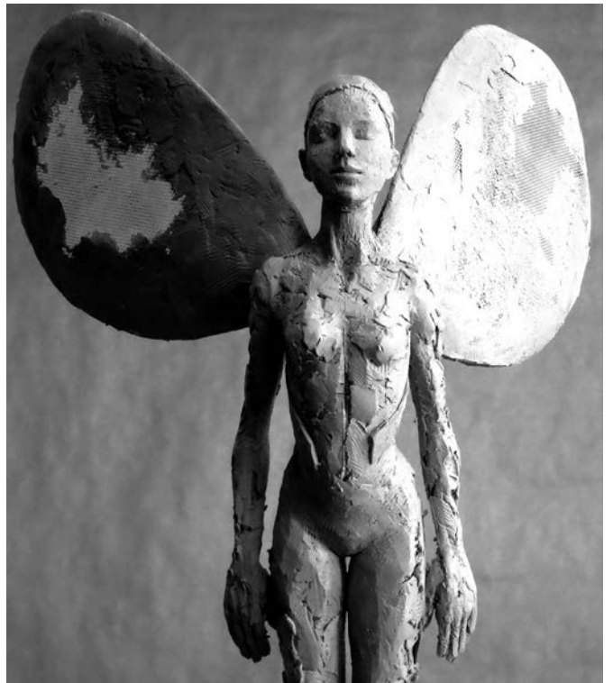
Red Ribbon Edition of 14 in bronze 127cm high Girl with Wings Edition of 14 in bronze 59cm high