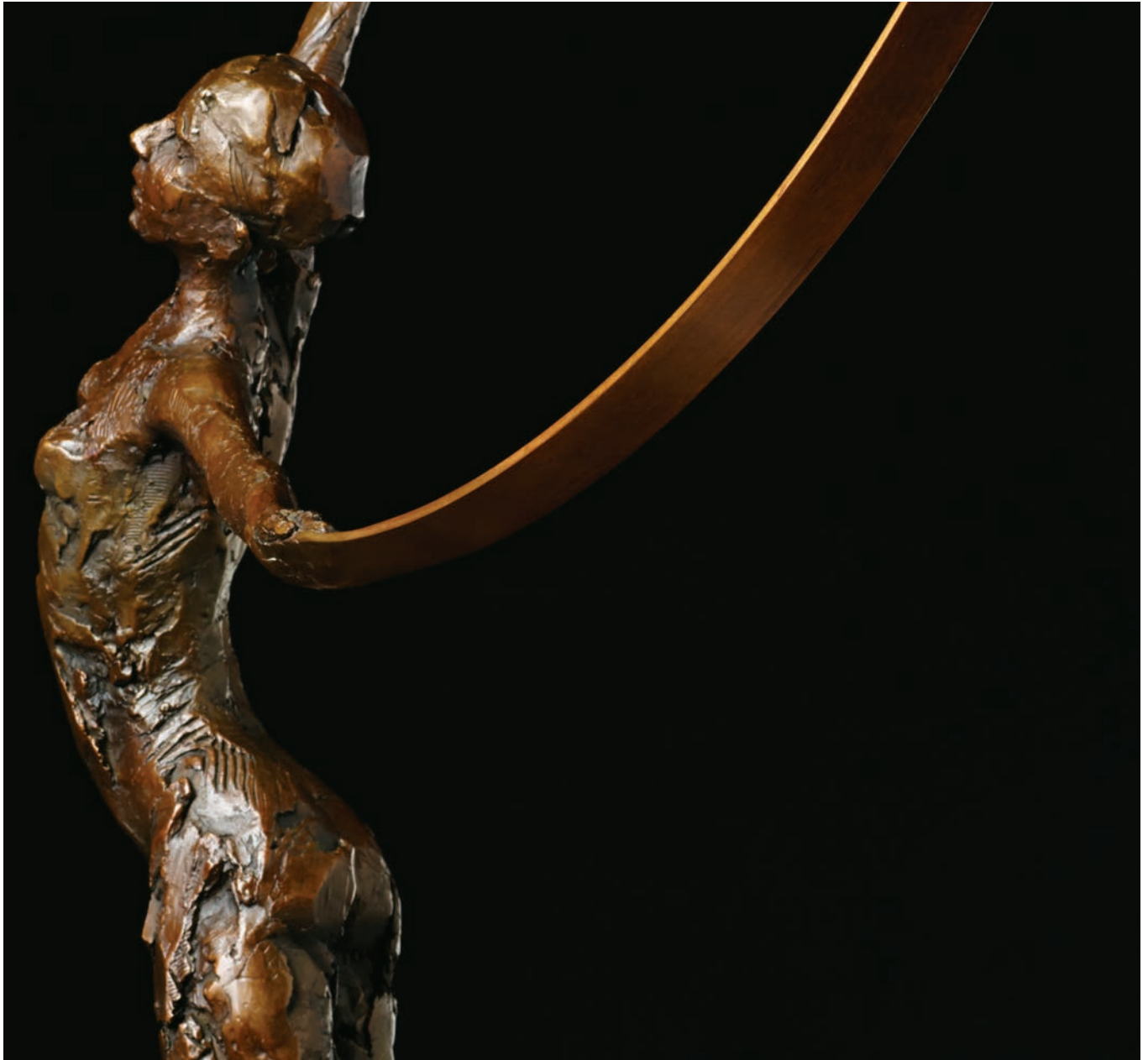
Red Ribbon Edition of I4 in bronze / 27cm high