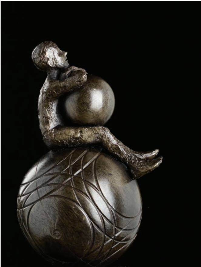
Boy with Balls Edition of 120 in iron resin 19cm high