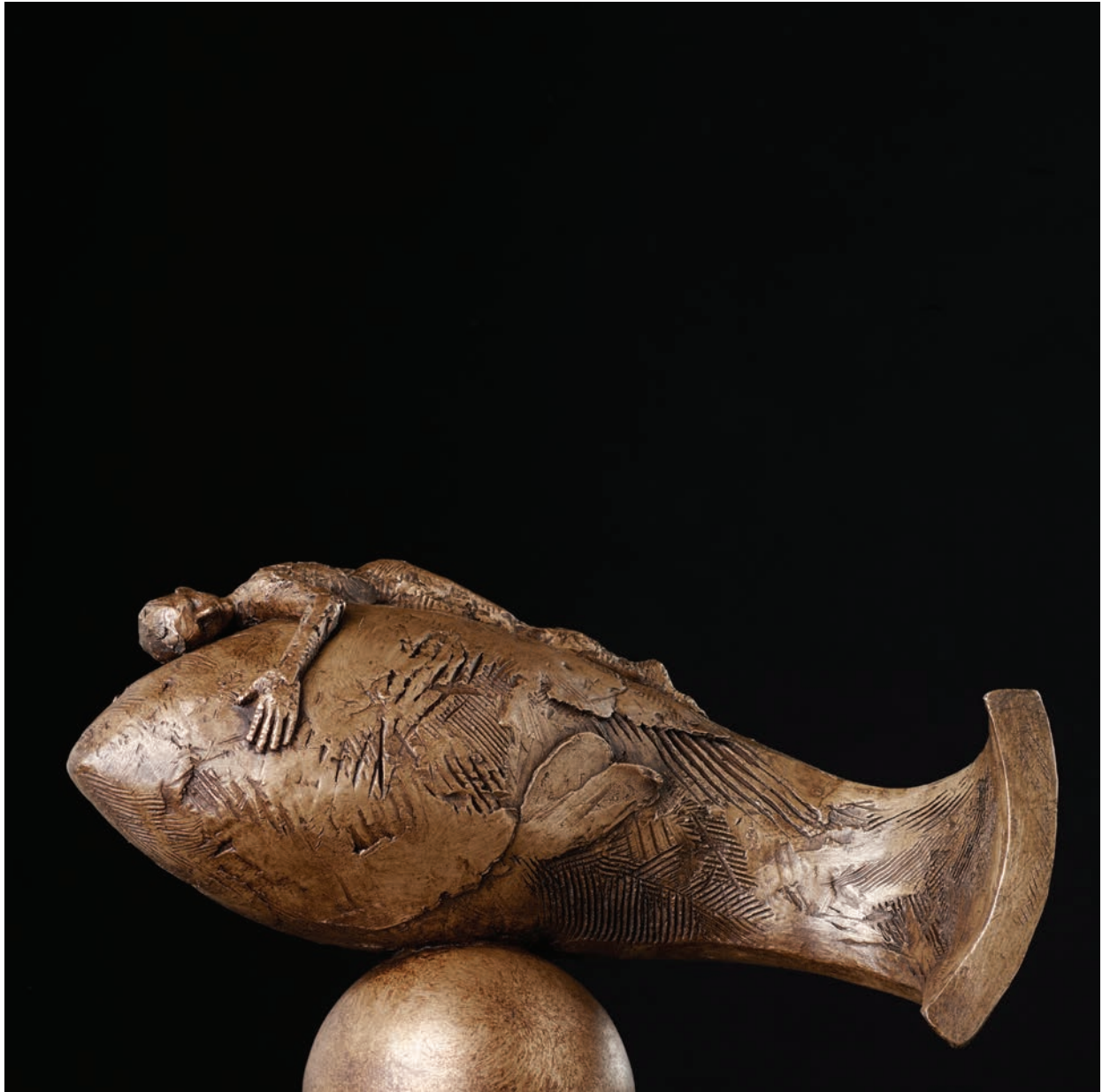
Love Edition of 25 in iron resin 17cm high