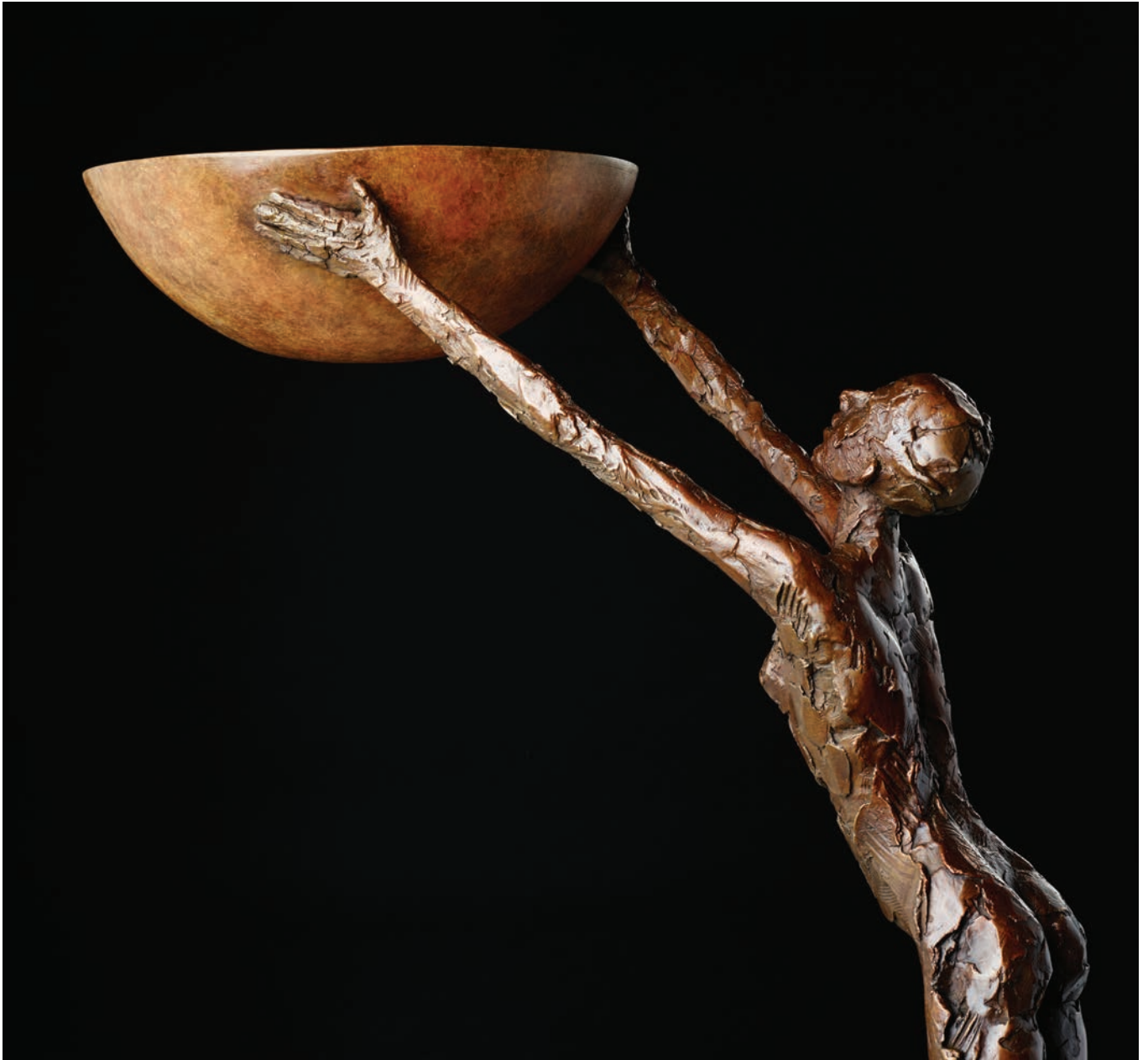
Gift Edition of 14 in bronze 85cm high